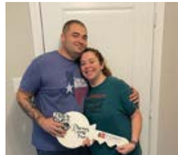
Why Should I Use A REALTOR to Buy/Sell My Home?