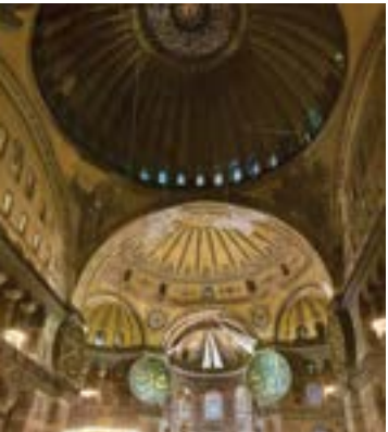
The Magical Place Where East Meets West Istanbul, Turkey