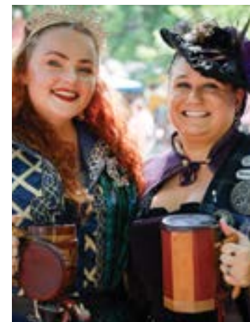
Step Back In Time for the Time of Your Life at Scarborough Renaissance Festival®! (continued)