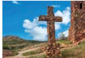
Area Church Directory