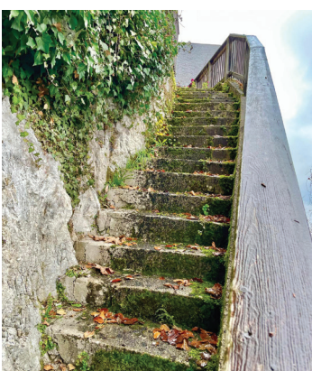
Hallstatt, Austria It's Not a Fairytale, It's Real

WAXAHACHIE, TX - Scarborough Renaissance Festival® returns April 8th for its 42nd season and will run eight consecutive weeks every Saturday & Sunday through Memorial Day Monday, May 29th. Scarborough Renaissance Festival® is one of the most unique, one-of-a-kind Festival experiences in North Texas offering interactive fun for everyone set in the 16th Century days of King Henry VIII. You will step back in time in our 35-acre re-creation of an English village filled with more than