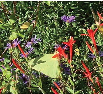
Denton County Master Gardener Association