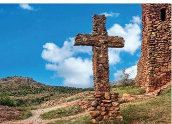
Area Church Directory