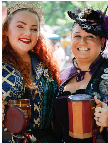
Step Back In Time for the Time of Your Life at Scarborough Renaissance Festival®! (continued)